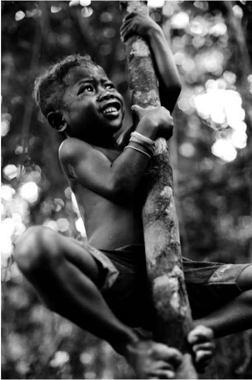
Figure 1. Photograph of a Batek (negrito) child climbing in the chinbodn or “frog” style.

Kraft et al. in press). Overall, there is abundant theoretical and empirical evidence to predict that variation in climbing-related loading history, particularly within an ontogenetic context, will generate diagnostic skeletal correlates.