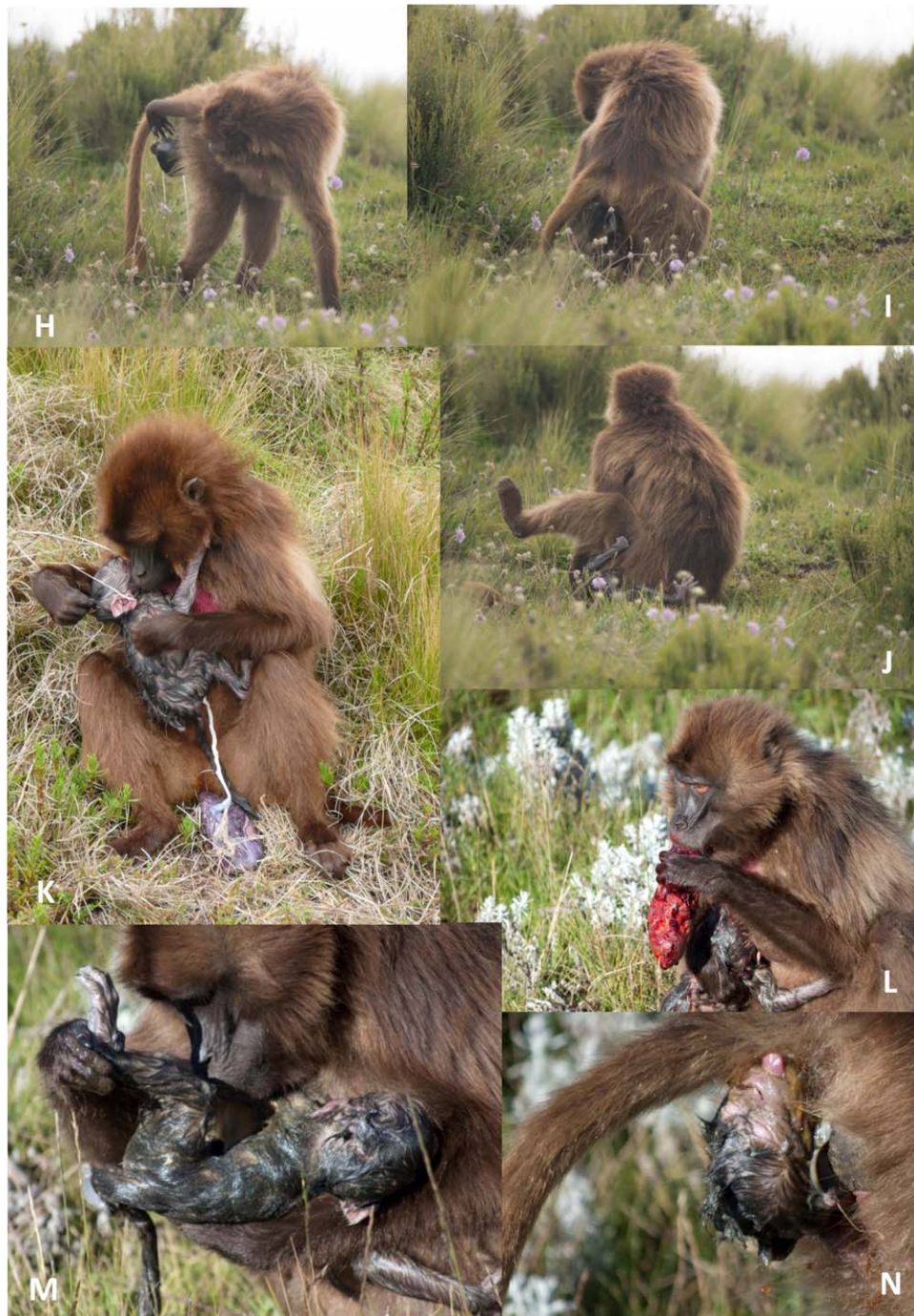
FIGURE 1 Continued

Intriguingly, one of the two vocalizing multiparas (Belle) was the only female in this study to successfully deliver an infant with its face directed towards the mother's spine, as opposed to her face, which is more typical for this species.